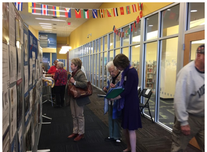
Every attendee took the time to read and enjoy the display: "Celebrating 100 Years of the League of Women Voters"